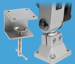
Heavy-Duty Mounting Clamp

The innovative ProVue Deluxe LED Magnifying lamp from Aven is the new standard in inspection lighting. This durable aluminum design features a 5 inch, 5 diopter glass lens for crystal clear, distortion-free viewing. Featuring 72 energy-efficient LED lights for shadow-free illumination.