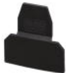
End cover, Length: 56 mm, Width: 2.5 mm, Height: 66.5 mm, Color: black