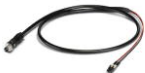
GOF MM cable, assembled with M12 OPTIC to LC duplex

Assembled FO cable, round cable, 50/125 µm GOF-MM fiber, M12 to LC duplex, for installation inside housing