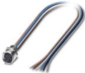
Sensor/actuator flush-type socket, 6-pos., M8, front/screw mounting with M8 fastening thread, with 0.5 m TPE litz wire, 6 x 0.14 mm 2

Please be informed that the data shown in this PDF Document is generated from our Online Catalog. Please find the complete data in the user's documentation. Our General Terms of Use for Downloads are valid ( http://download.phoenixcontact.com )