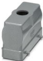
HEAVYCON B24 sleeve housing, for double locking latch, height: 65 mm, with 1 x M32 thread, straight cable outlet

Please be informed that the data shown in this PDF Document is generated from our Online Catalog. Please find the complete data in the user's documentation. Our General Terms of Use for Downloads are valid ( http://phoenixcontact.com/download )