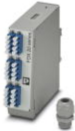
DIN rail splice box, fully mounted ready to splice, for 12x LC duplex (OS2)

Please be informed that the data shown in this PDF Document is generated from our Online Catalog. Please find the complete data in the user's documentation. Our General Terms of Use for Downloads are valid ( http://phoenixcontact.com/download )