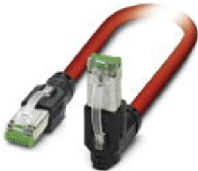
SERCOS III patch cable, shielded, star quad, AWG 22 stranded (7-wire), RAL 3020 (traffic red), RJ45 connector/IP 20, straight, to RJ45 connector/IP20, angled, length: 2.0 m

Please be informed that the data shown in this PDF Document is generated from our Online Catalog. Please find the complete data in the user's documentation. Our General Terms of Use for Downloads are valid ( http://download.phoenixcontact.com )