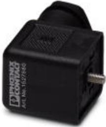
Valve connector, 3-pos., type B, unconnected, screw connection, cable screw connection Pg9

Please be informed that the data shown in this PDF Document is generated from our Online Catalog. Please find the complete data in the user's documentation. Our General Terms of Use for Downloads are valid ( http://download.phoenixcontact.com )