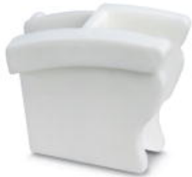
Switching lock, length: 12 mm, width: 6.2 mm, color: white

Please be informed that the data shown in this PDF Document is generated from our Online Catalog. Please find the complete data in the user's documentation. Our General Terms of Use for Downloads are valid ( http://phoenixcontact.com/download )