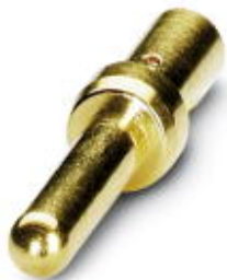
Crimp contact, turned, Single contact, contact diameter: 1 mm, crimp range: 0.14 mm 2 ... 0.56 mm 2

Please be informed that the data shown in this PDF Document is generated from our Online Catalog. Please find the complete data in the user's documentation. Our General Terms of Use for Downloads are valid ( http://phoenixcontact.com/download )