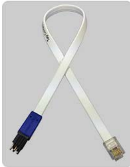
Tag-Connect cable for connector-less PCB's