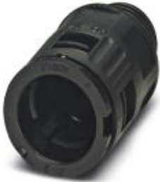
Cable gland, metric thread, IP66 protection, straight

Please be informed that the data shown in this PDF Document is generated from our Online Catalog. Please find the complete data in the user's documentation. Our General Terms of Use for Downloads are valid ( http://phoenixcontact.com/download )