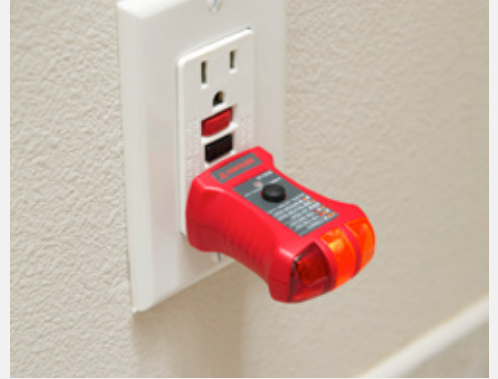
ST-102B Socket Tester with GFCI