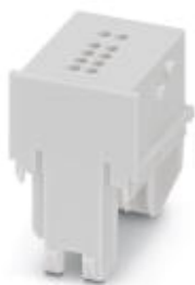
Component housing, length: 111.9 mm, Cover, color: light gray, width: 20.94 mm, height: 16.3 mm

Please be informed that the data shown in this PDF Document is generated from our Online Catalog. Please find the complete data in the user's documentation. Our General Terms of Use for Downloads are valid ( http://phoenixcontact.com/download )