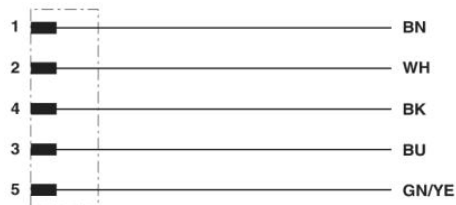
Contact assignment of the M12 plug