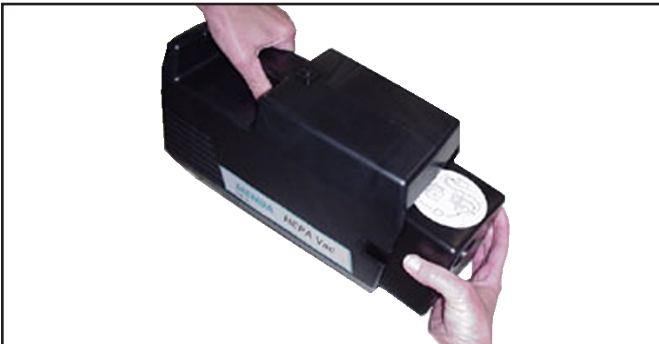
Figure 4: Sliding the cartridge out.

Grasp the handle of the vacuum, tilt it forward at a 45 degree angle, and slide the filter cartridge out.