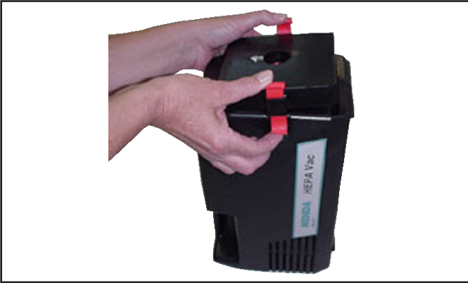
Figure 3: Lifting out the cartridge.

Unplug the HEPA Vac or Service Vac from the electrical power. Remove the flex-hose. Sit the vacuum upright, resting the back of the unit with the inlet door facing you. mechanism on the body of the vacuum. Then pull the door toward you, being careful not to damage the ground wire (door may hang by ground wire while the new filter is being inserted).