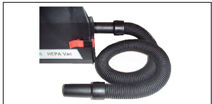
Figure 2: Attaching flex-hose

Attach the flex-hose securely to the front of the vacuum. With thumb and forefinger, pull out the curved side tabs of the inlet door until they are free from the latching.