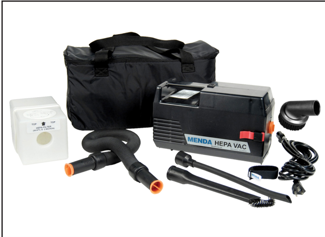
Figure 1: Menda's HEPA Vacuum