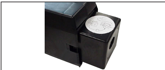
Figure 5: Reinstalling the filter cartridge.

Dispose of the filter in an appropriate manner. Reinstall a new filter cartridge with the pleated paper end toward the motor. The label on the filter should be facing up.