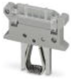
Isolating connector, for using the base fuse terminal block as plug disconnect terminal block