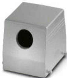
HEAVYCON sleeve housing B 32, for double locking latch, height 80 mm, without support 1x M32, lateral conductor exit

Please be informed that the data shown in this PDF Document is generated from our Online Catalog. Please find the complete data in the user's documentation. Our General Terms of Use for Downloads are valid ( http://phoenixcontact.com/download )