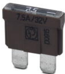
Flat-type plug-in fuse, type C, color code: brown, nominal current: 7.5 A

Please be informed that the data shown in this PDF Document is generated from our Online Catalog. Please find the complete data in the user's documentation. Our General Terms of Use for Downloads are valid ( http://phoenixcontact.com/download )