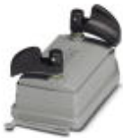
HEAVYCON ADVANCE IP65 protective cover B6, with bayonet locking, with retaining cord, diameter of retaining cord eyelet 3 mm

Protective covers - HC-B 6-TMB-SD-IP65 - 1690930