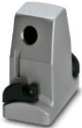
HEAVYCON ADVANCE EMV sleeve housing B6, with bayonet locking, height 100 mm, with 1xM20 thread, lateral cable outlet

Please be informed that the data shown in this PDF Document is generated from our Online Catalog. Please find the complete data in the user's documentation. Our General Terms of Use for Downloads are valid ( http://download.phoenixcontact.com )