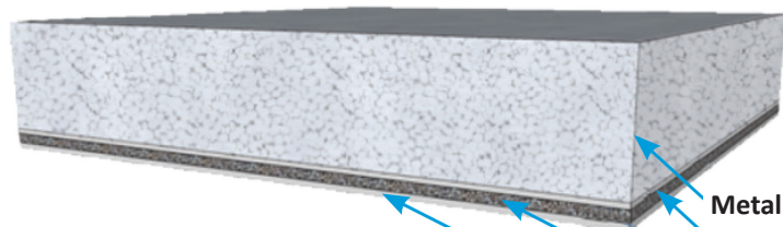
EcoFoam™ 500-Series with CPSA

Metallized Foam Adhesive Layer Metallized Fabric Tape Conductive PSA