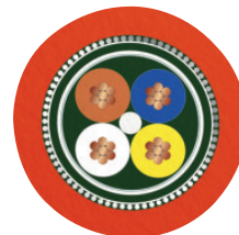
Sercos III [93K]