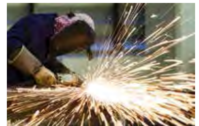
WeldWrap bundles and protects hoses on welding robots and static welding stations.