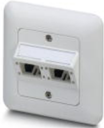
Terminal outlet, flush-type mounting, IP20, two slots for contact inserts with the Freenet system

Please be informed that the data shown in this PDF Document is generated from our Online Catalog. Please find the complete data in the user's documentation. Our General Terms of Use for Downloads are valid ( http://download.phoenixcontact.com )