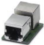
RJ45 socket insert, for the Freenet system, CAT5e, 8-pos., shielded, socket on socket

RJ45 female insert - VS-08-BU-RJ45-5-F/BU - 1652952