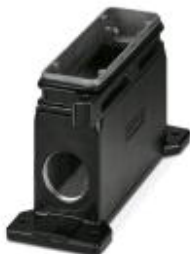
HEAVYCON B24 box mounting base, for screw locking, HPR series, with 2 x M40 gland, for increased environmental and EMC requirements

Please be informed that the data shown in this PDF Document is generated from our Online Catalog. Please find the complete data in the user's documentation. Our General Terms of Use for Downloads are valid ( http://phoenixcontact.com/download )