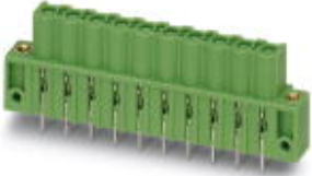
The figure shows a 10-position version of the product

Header, Nominal current: 12 A, Rated voltage (III/2): 320 V, Number of positions: 19, Pitch: 5.08 mm, Color: green, Contact surface: Tin, Assembly: Soldering