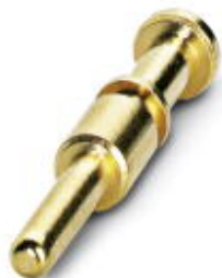
Crimp contact, turned, contact diameter: 2 mm, crimp range: 0.25 mm 2 ... 1 mm 2

Please be informed that the data shown in this PDF Document is generated from our Online Catalog. Please find the complete data in the user's documentation. Our General Terms of Use for Downloads are valid ( http://phoenixcontact.com/download )