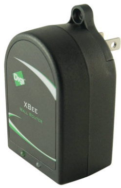
Smart Energy Range Extender